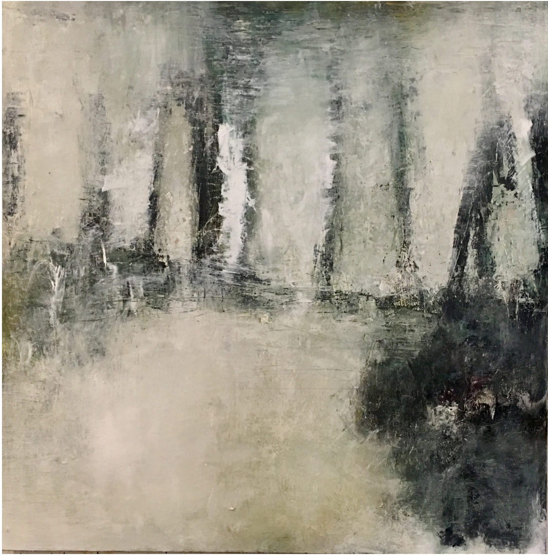
Woodhaven , 2016, Cold wax and oil on canvas, 36 x 36 inches