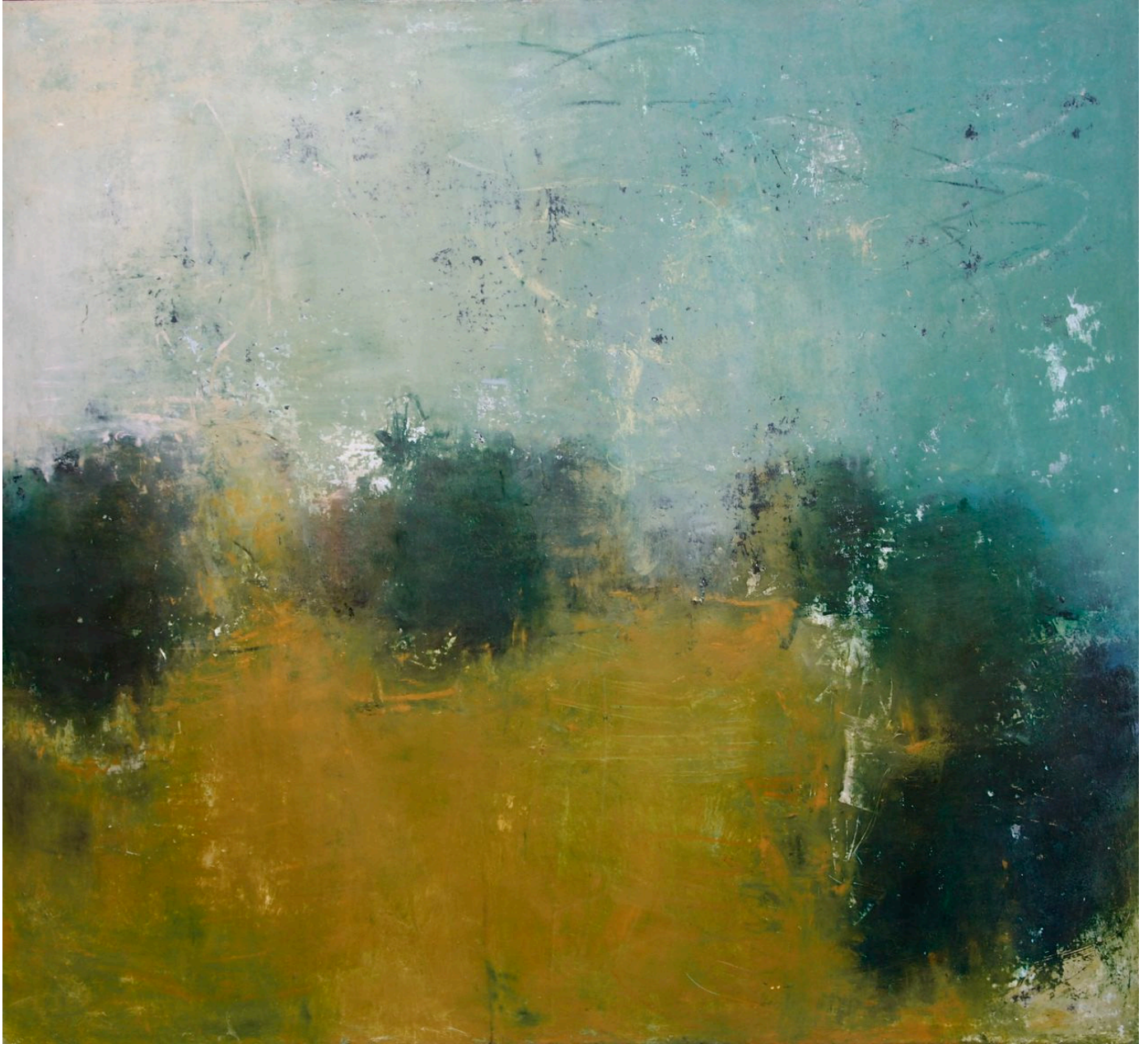
Sceaux , 2014, Cold wax and oil on canvas, 54 x 54 inches