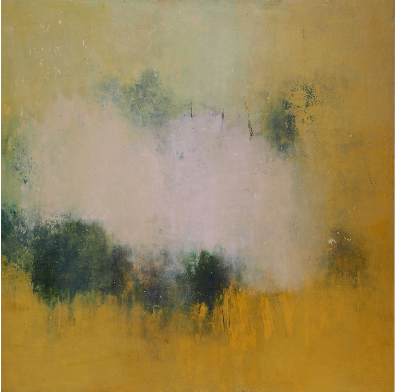
Le Croisic , 2012, Cold wax and oil on canvas, 54 x 54 inches