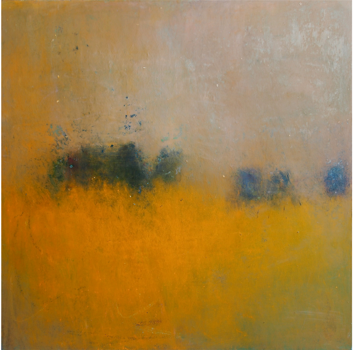
Coquelicot , 2010, Cold wax and oil on canvas, 48 x 48 inches