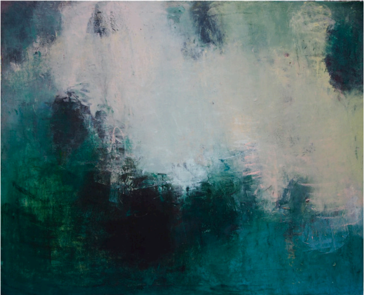
Joshua Trees , 2014, Cold wax and oil on canvas, 44 x 54 inches